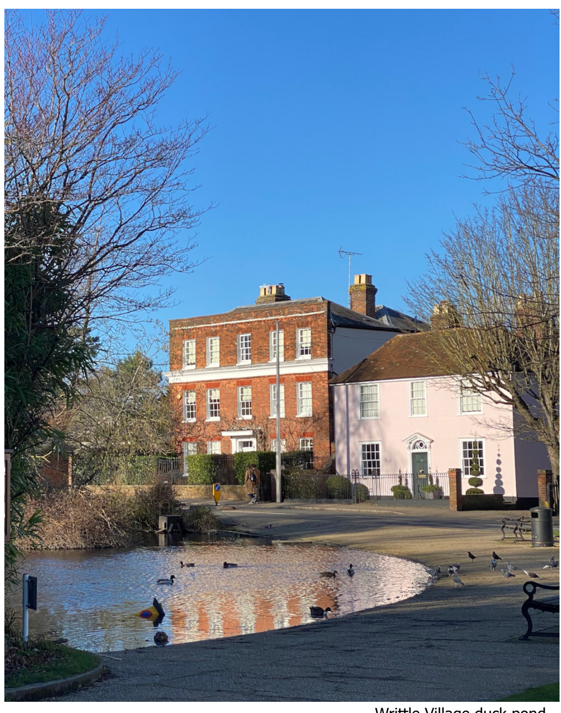
Writtle Village duck pond